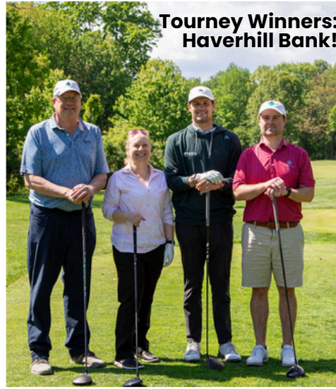
Tourney Winners: Haverhill Bank!