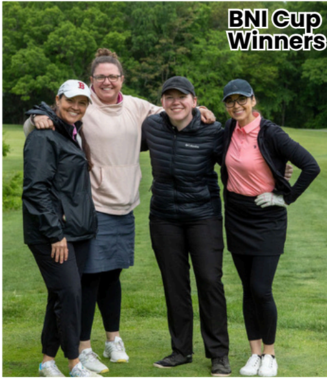
BNI Cup Winners

Thanks to all for making this year our most successful tourney to date!